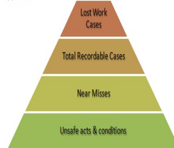
Loss prevention pyramid

Only a fortunate break in the chain of events prevented an injury, fatality or damage; in other words, a miss that was nonetheless very near.