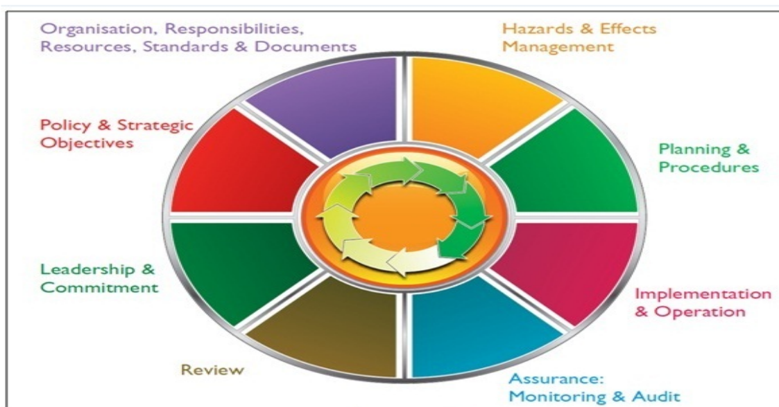
HSE Management System (CP-122) which incorporates the requirements of ISO 14001:2004

PDO has developed a comprehensive HSE Management System (CP-122) which incorporates the requirements of ISO 14001-2004. The HSE Policy incorporates the requirements of the ISO 14001 system standard. The policy calls for compliance with legal requirements so that no harm is posed to people and the environment. One of the key requirements of the ISO 14001 is to develop an Environmental Aspect and Impact register . Aspect identification is important, since it is from this identification of the potential to impact the environment that the rest of the EMS is built.