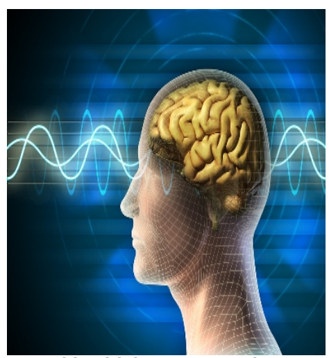
Mental health issues at work